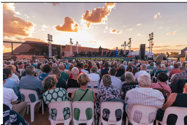
DARK SKY SERENADE

The 2024 Festival of Outback Opera in Winton and Longreach concluded on Monday May 20, marking another successful celebration of Opera in the heart of Queensland's outback.