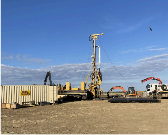
The bore drilling machine