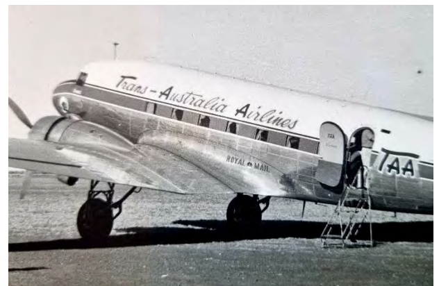
TAA in Winton