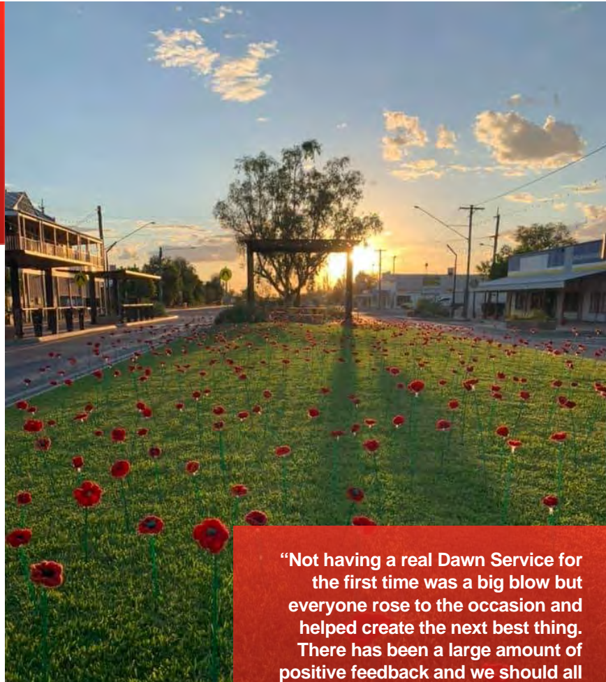
Winton Neighbourhood Centre’s Poppy display in the main street.

“Not having a real Dawn Service for the first time was a big blow but everyone rose to the occasion and helped create the next best thing. There has been a large amount of positive feedback and we should all very proud of a job well done.”