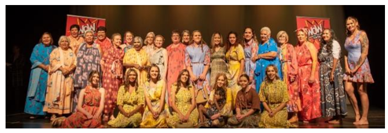
Fashions from Red Ridge the Label.

Day and Queensland Women's Week, WOW Longreach will host a very special lunch on Sunday March 6 for all participants, addressed by a range of inspiring speakers, and young women and girls on their future hopes and ambitions.